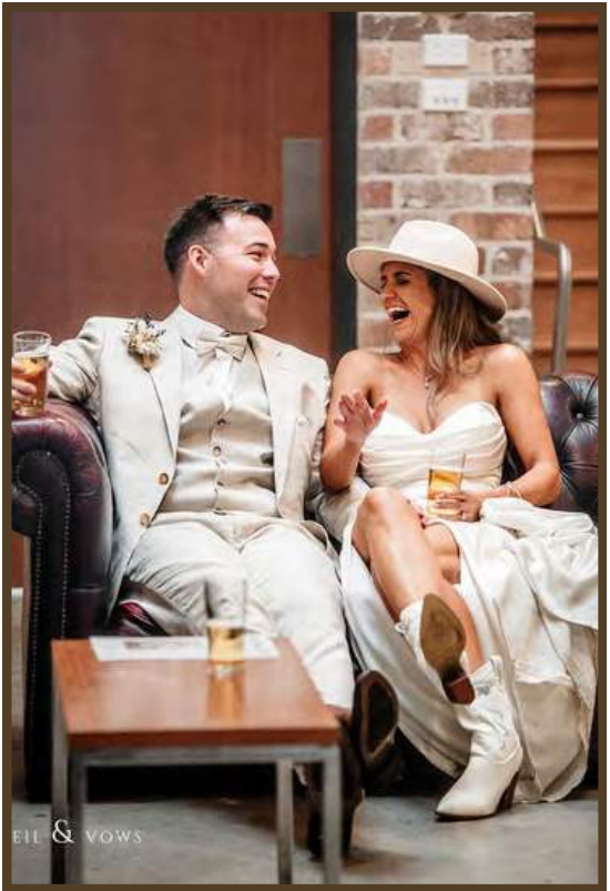
VEIL & VOWS