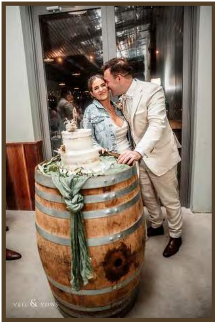
VEIL & VOWS