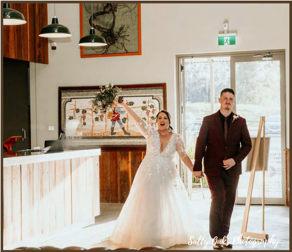
Sally Oaks Photography