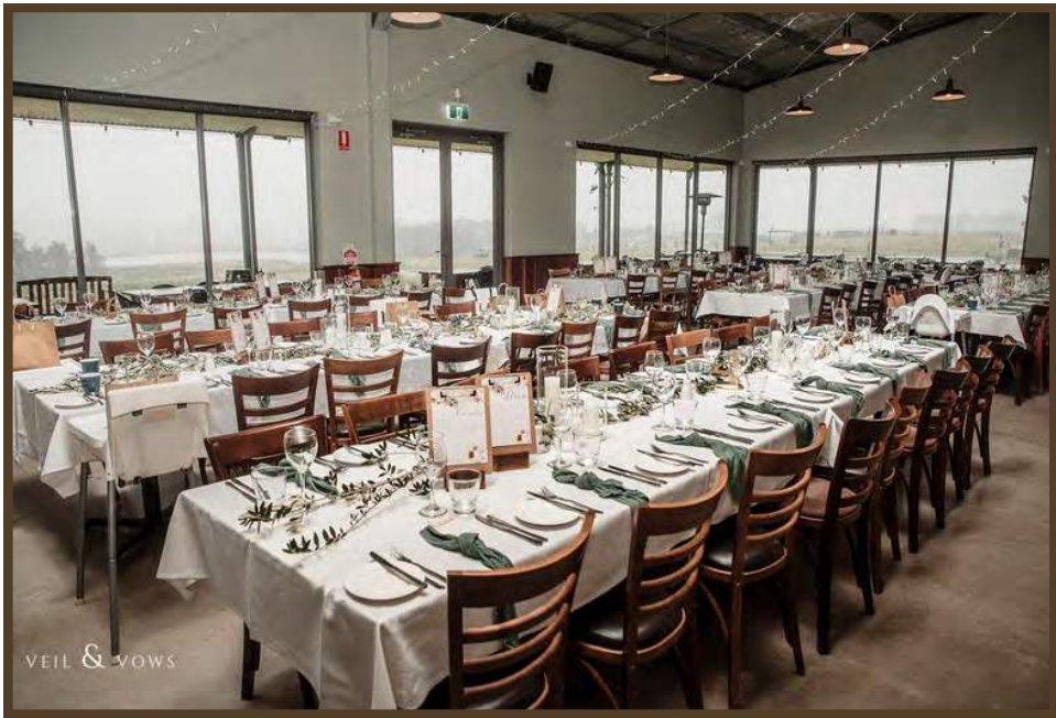
VEIL & VOWS