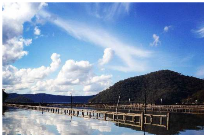
10:45 - Central Coast and Hunter scenery.