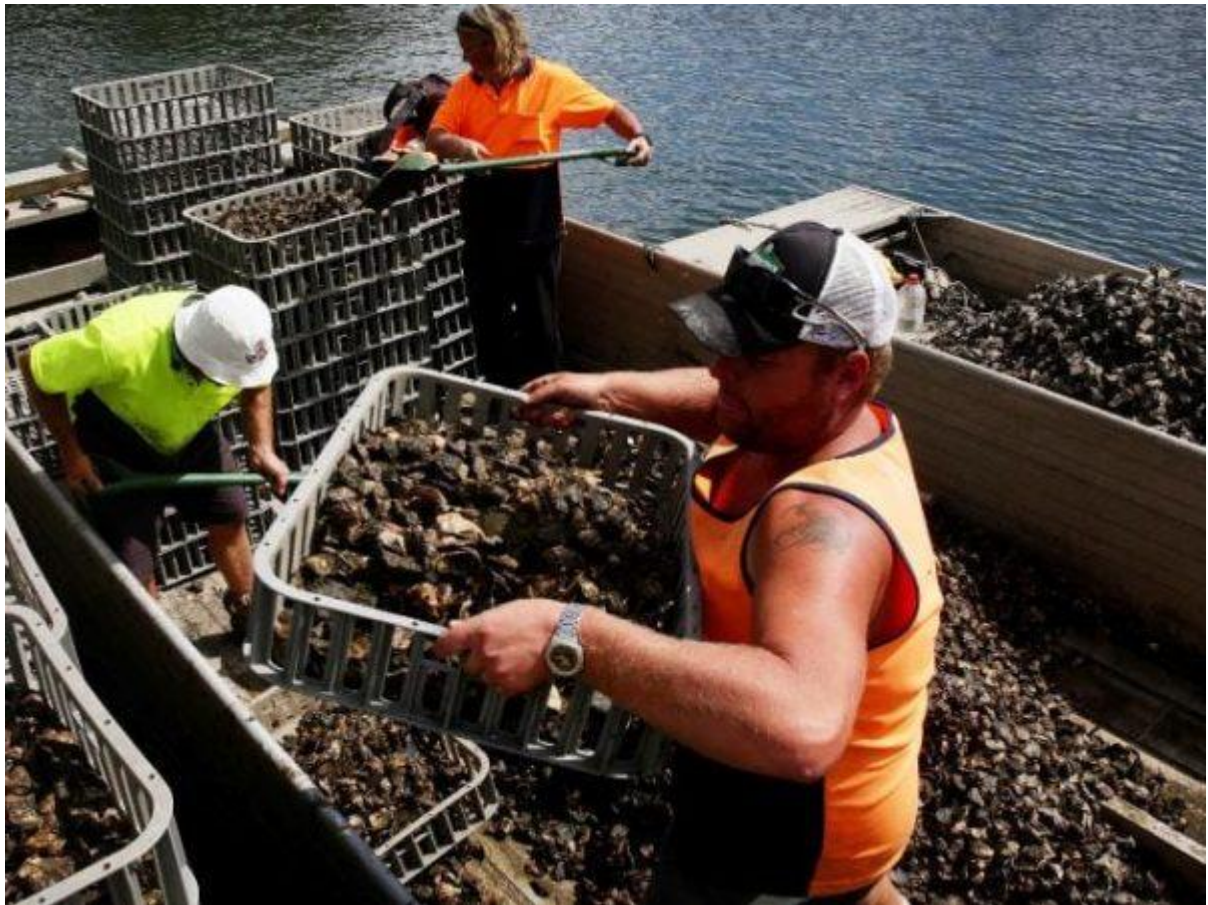
10:45 Central Coast and Hunter scenery