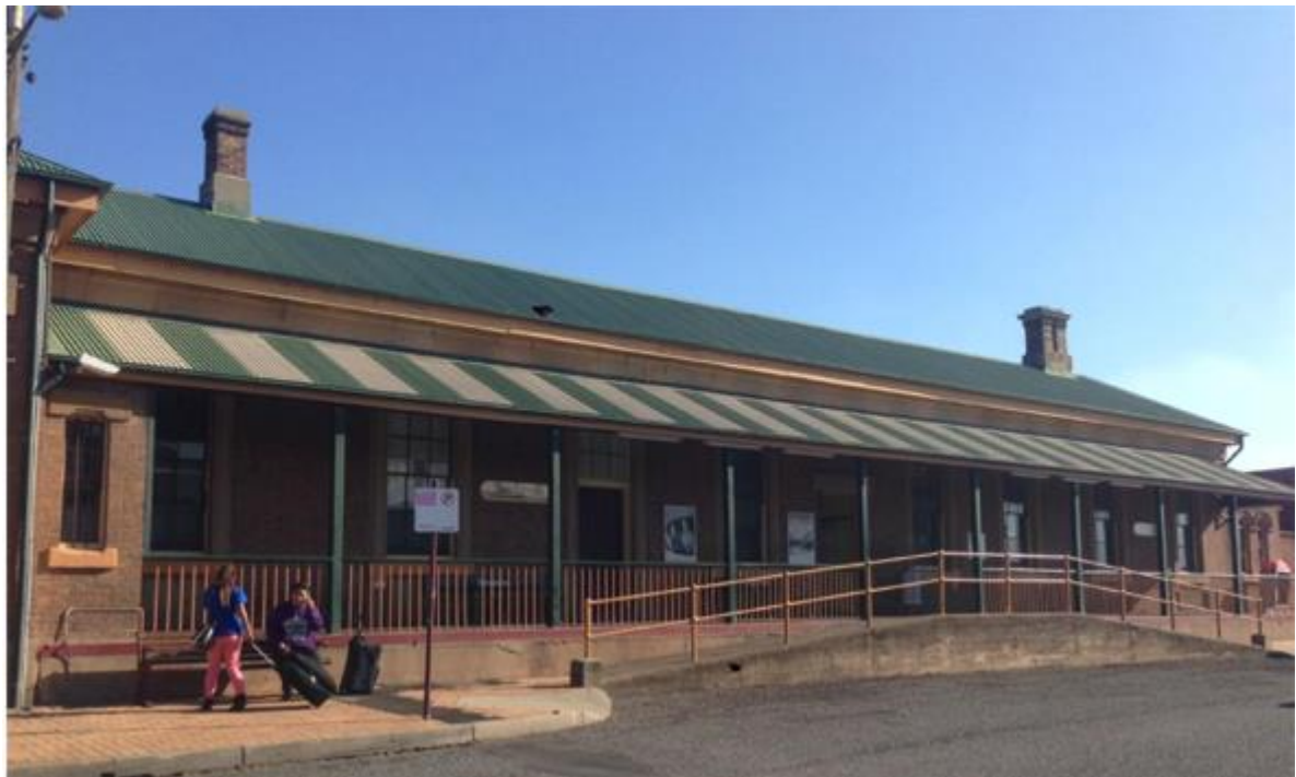
12:40 Arrive Singleton Railway station (Hunter Valley) with Meet & Greet and return transfers from station to Hunter Valley Resort in our Mercedes Benz